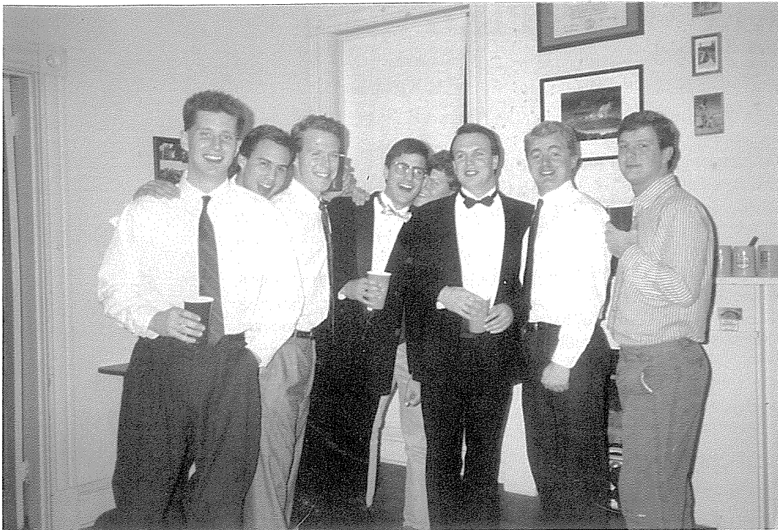
Alumni, future alumni, and never to become alumni—partying on New Year's Eve.

THE LINK LAMBDA CHI ALPHA 413 E. ROANOKE ST. BLACKSBURG, VA 24060